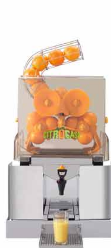
Citrocasa 6000 XB Art.-No. 80.101 Stainless steel pedestal 8 cm 6000/7000 series with drip plate Art.-No. 70.880 Fruit sieve support with tap Art.-No. 22.034.99

With a capacity of 1.6 litres of juice per minute, with its compact size and elegant design, the CITROCASA 6000 XB will bring you and your customers huge satisfaction.