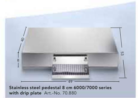
Stainless steel pedestal 8 cm 6000/7000 series with drip plate Art.-No. 70.880