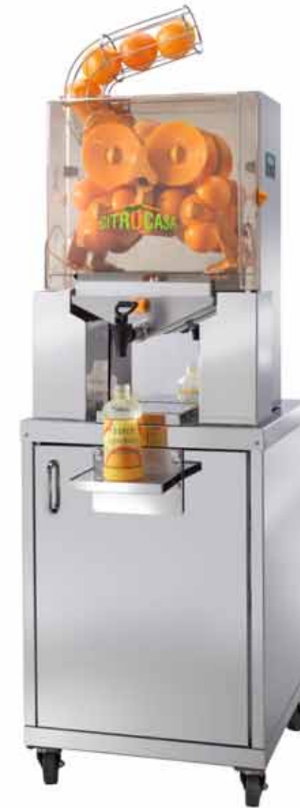
Citrocasa 6000 XB Art.-No. 80.101 Stainless Steel Cabinet 6000/7000 Art.-No. 70.100 Fruit sieve support with tap Art.-No. 22.034.99