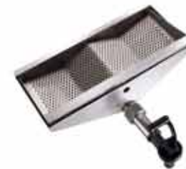
Fruit sieve support with tap Art.-No. 22.034.99