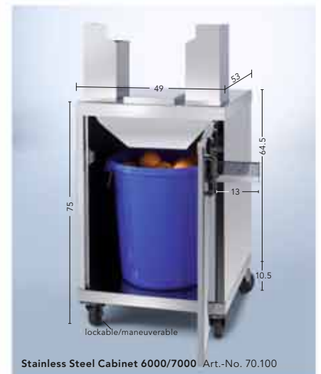
Stainless Steel Cabinet 6000/7000 Art.-No. 70.100