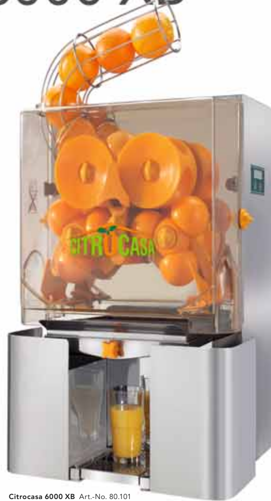
Citrocasa 6000 XB Art.-No. 80.101

To call the CITROCASA 6000 an entry model into a new dimension of good taste is an understatement.