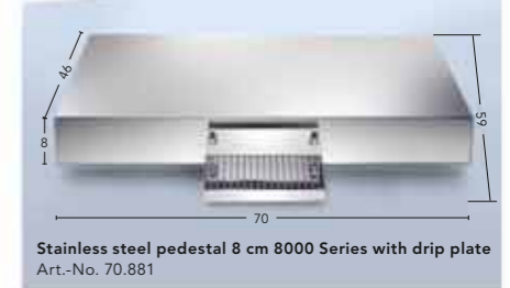
Stainless steel pedestal 8 cm 8000 Series with drip plate Art.-No. 70.881