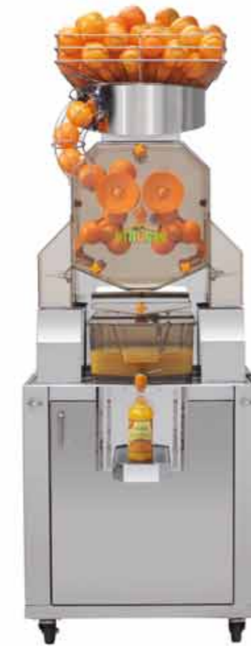
Citrocasa 8000 XB with Juice-Tank Art.-No. 80.002 Stainless Steel Cabinet 8000 Art.-No. 70.000