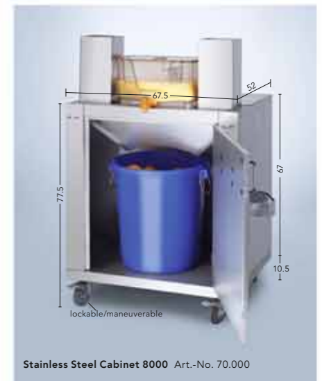
Stainless Steel Cabinet 8000 Art.-No. 70.000