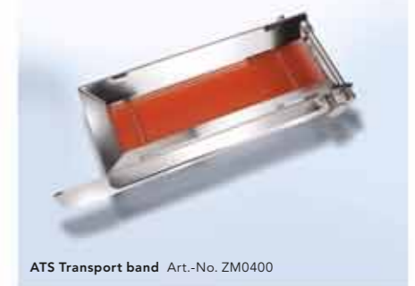
ATS Transport band Art.-No. ZM0400