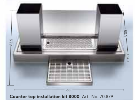
Counter top installation kit 8000 Art.-No. 70.879