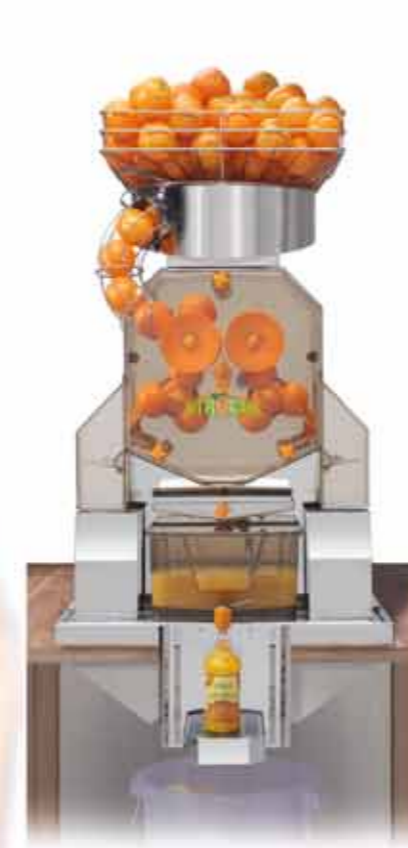
Citrocasa 8000 XB with Juice-Tank Art.-No. 80.002 Countertop installation kit with drip plate Art.-No. 70.879