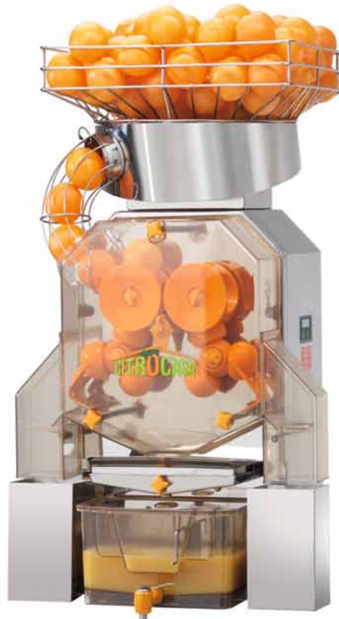
Citrocasa 8000 XB with Juice-Tank Art.-No. 80.002